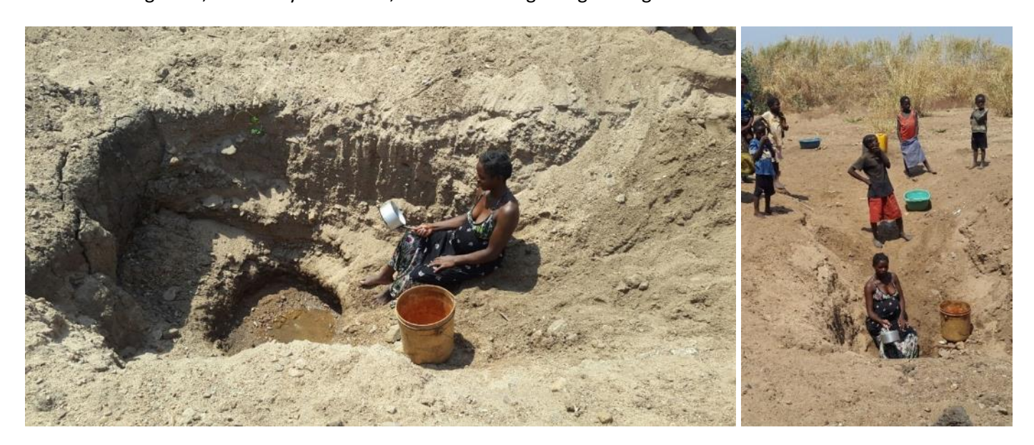
Luckily, the solution here in the Luangwa Valley is extremely simple – communal boreholes equipped with sturdy,' low tech' hand pumps.

In many places here in the Luangwa valley there isn't even access to shallow wells and the community has to resort to digging in the seasonal river beds. This task always falls to the women and children. Water collection in the drier months is dangerous, extremely hard work, time consuming and gruelling.