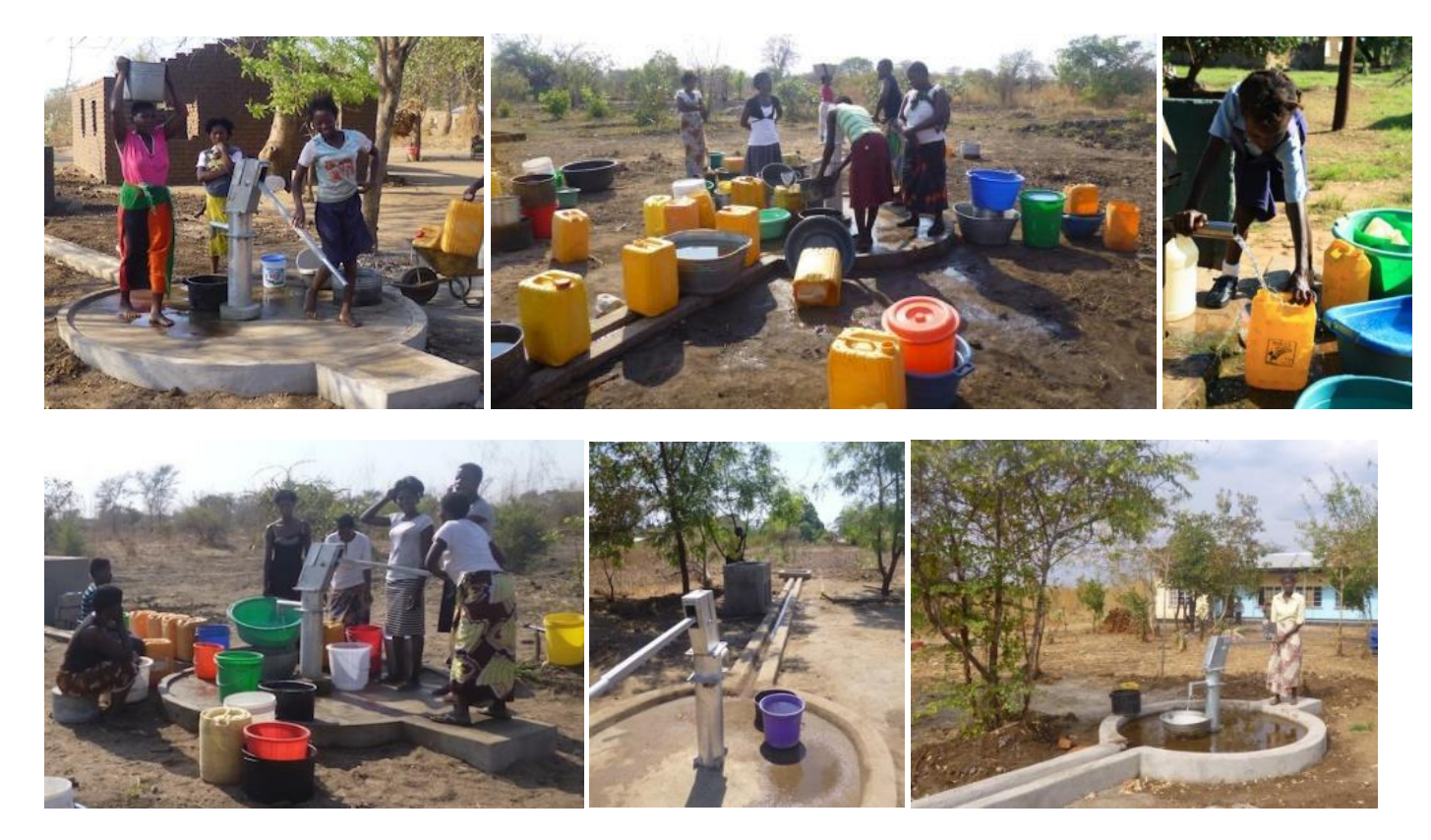
Settlements usually consist of extended families grouping together into small villages. The water requirements for a settlement like this can be provided for by a properly installed borehole – serving perhaps two to three hundred people. It only takes about a week to drill and install the borehole, and to transform lives forever.