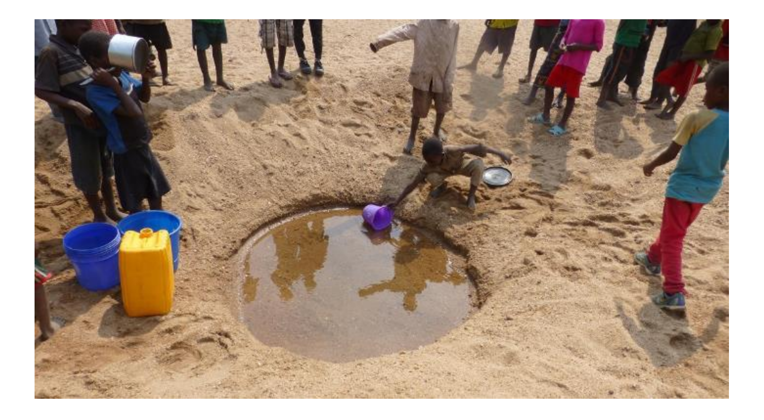
A community is identified.