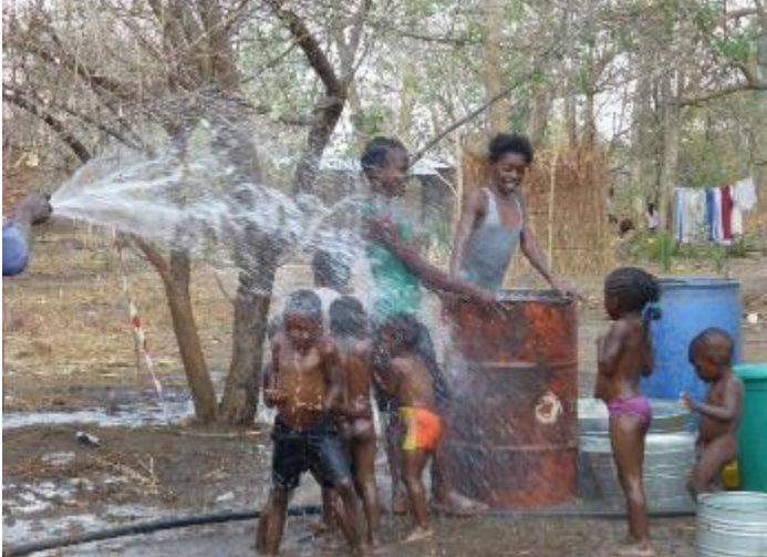
Clean, fresh water for the first time in the village