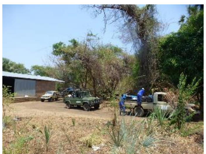
Mobilising from our base in the Valley